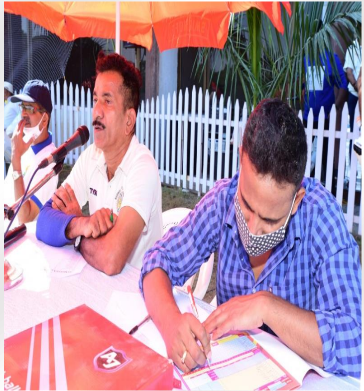
Veteran match at Panjim Gymkhana