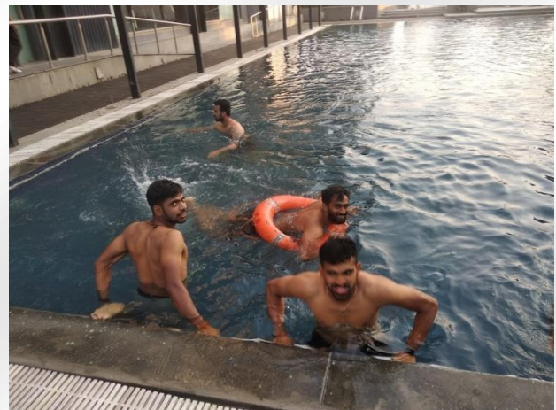
Team Goa in Surat for Vijay Hazare Trophy 2020-21