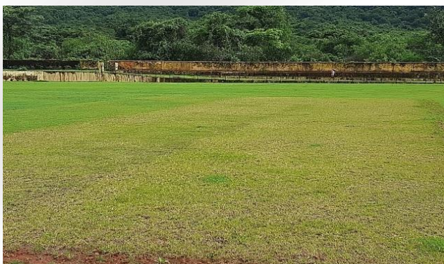
DHARBANDODA CRICKET GROUND