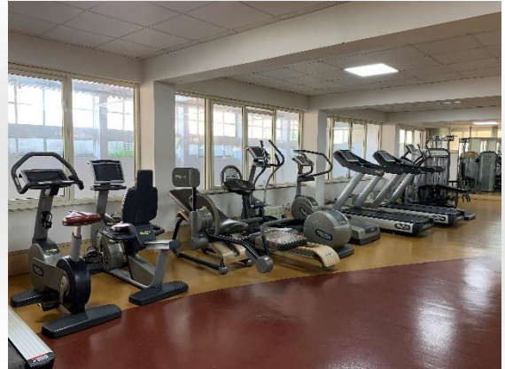
Gymnasium at Goa Cricket Association