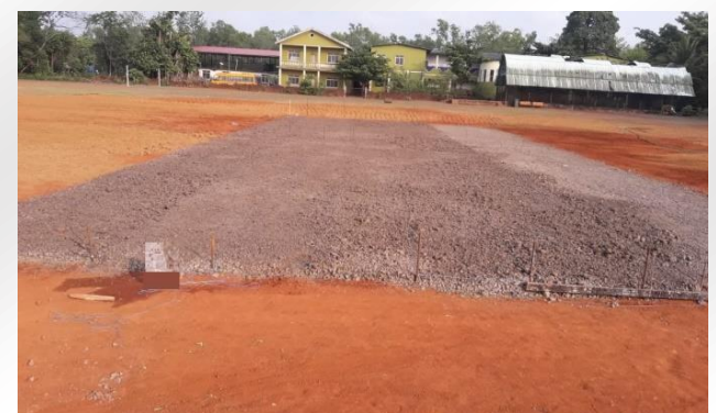
MASHEM CRICKET GROUND