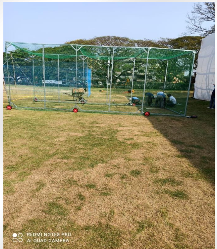
1 st Practice Session at Panjim Gymkhana