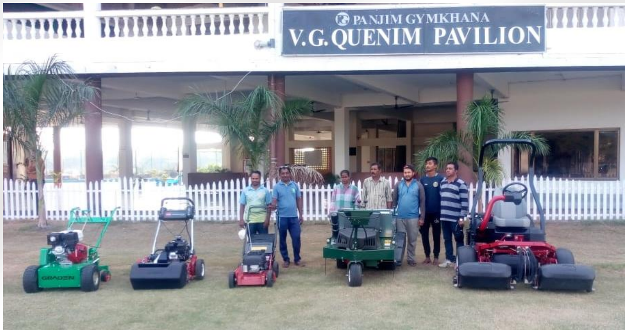
New Ground Maintenance Machinery Purchased for use at Panaji Gymkhana Ground