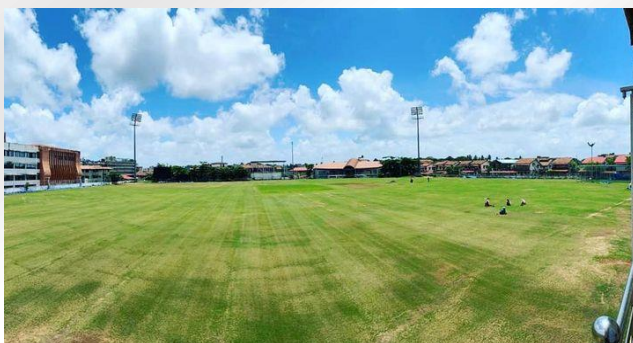
GCA GROUND PORVORIM