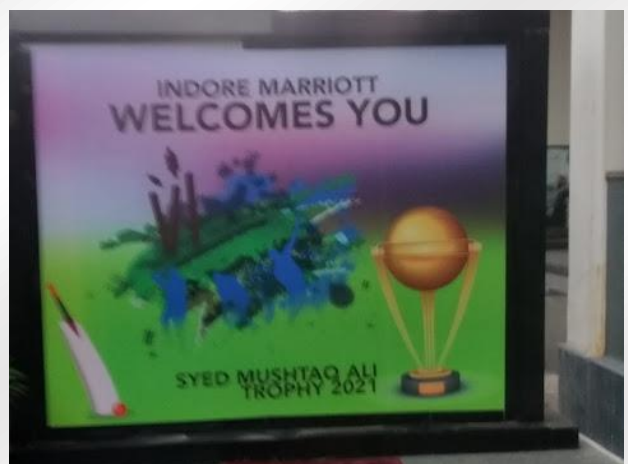
Team Goa in Indore For Syed Mushtaq Ali Trophy 2020-21