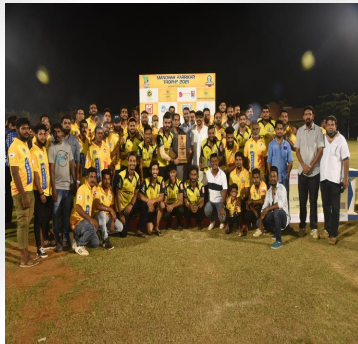
INAUGURAL MANOHAR PARRIKAR TROPHY 2021 HELD AT GCA GROUND PORVORIM