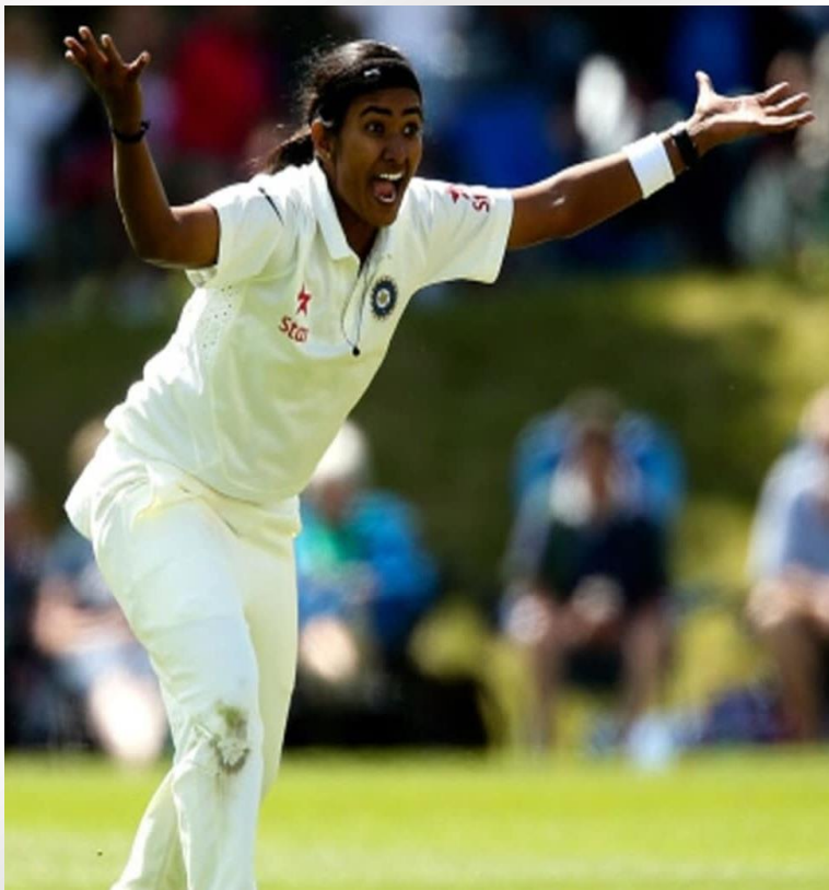
Shikha Pandey, the girl who emerged from Goa and rattled world cricket.