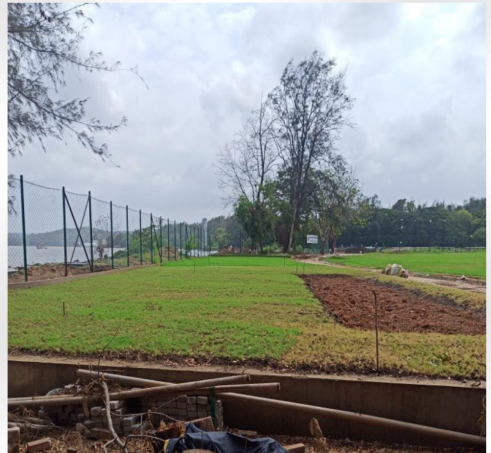
Outdoor Net Preparation at Panjim Gymkhana Ground