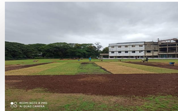
Panjim Gymkhana Ground Pitch and Ground Preparation