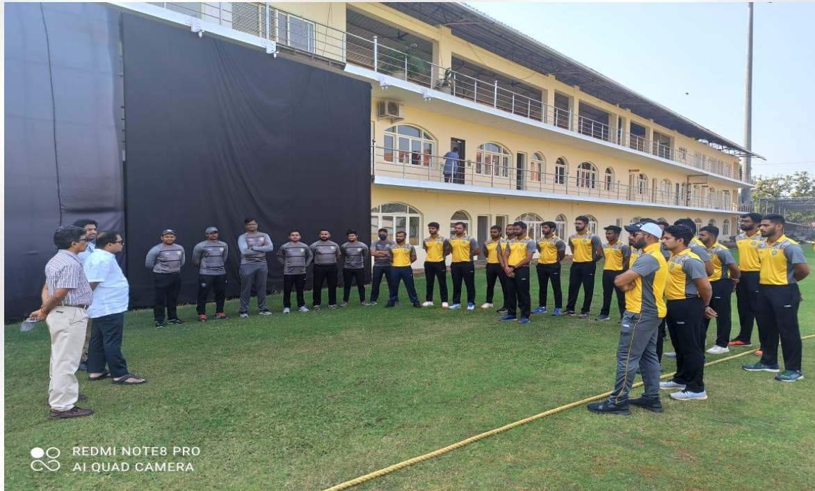
The President addressing team before the start of the Season