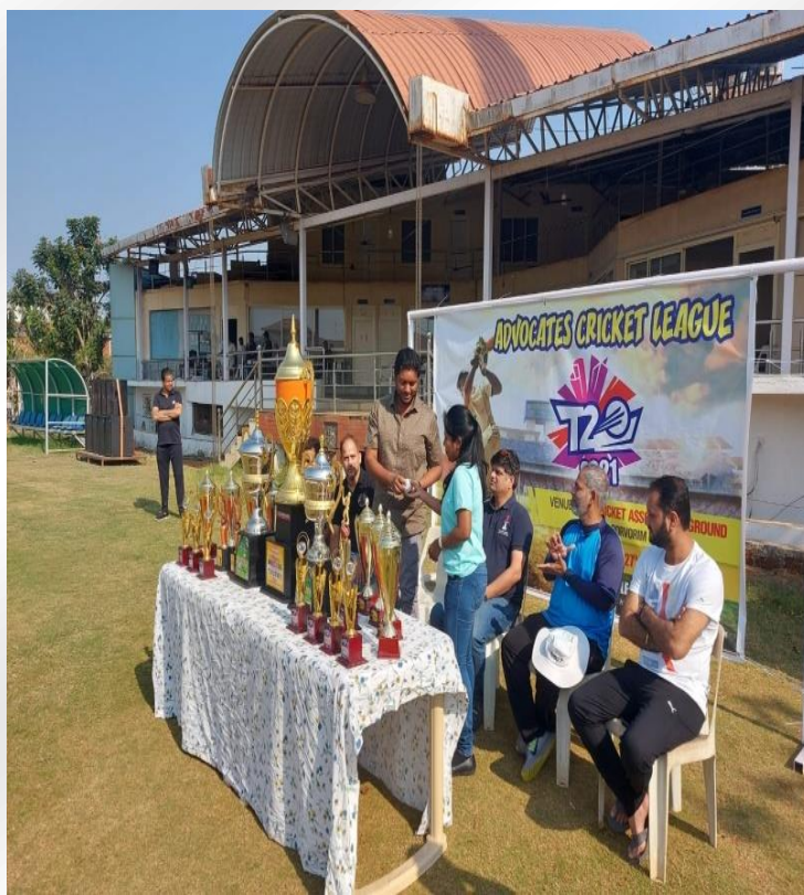
ADVOCATES T-20 CRICKET LEAGUE 2021 HELD AT GCA GROUND PORVORIM